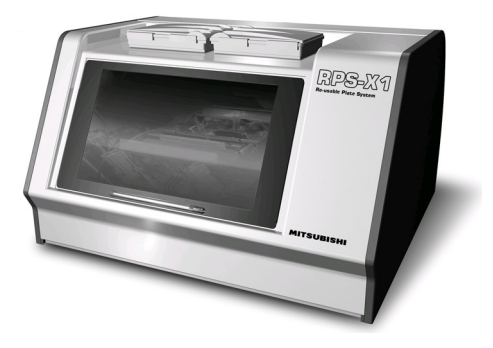
Figure 2. RPS-X1

proven that recycling is possible up to 20 times by preventing accumulation of residues in erasing as much as possible. For the above reasons, an epoch-making system configuration which deals with a small lot of up to 25,000 in average to allow reduction in printing material cost and efficient workflow has been realized while maintaining the same level of productivity as that of the conventional offset press.